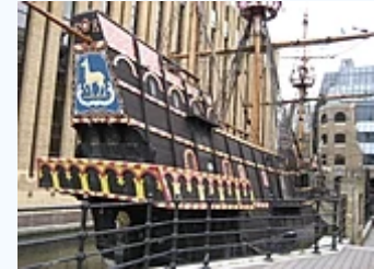
Replica of the Golden Hind